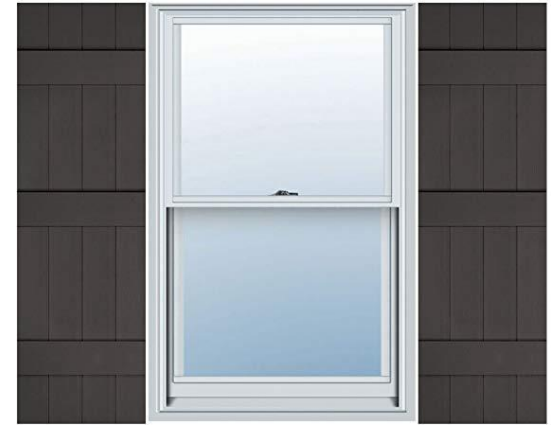
New Windows & Adding Shutters