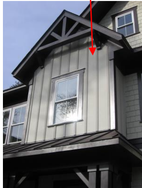
Side windows will be opaque