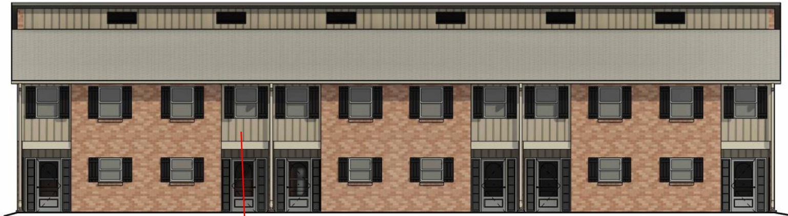
Board and Batten Siding