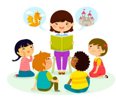
Afternoon Storytime LIVE! Wednesdays at 1PM Join us for a Storytime Wednesday! For Kids of All Ages. *Registration Required